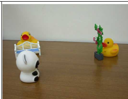
2. After the ducks hide themselves, the panda says “There must be someone hiding behind the tree.”