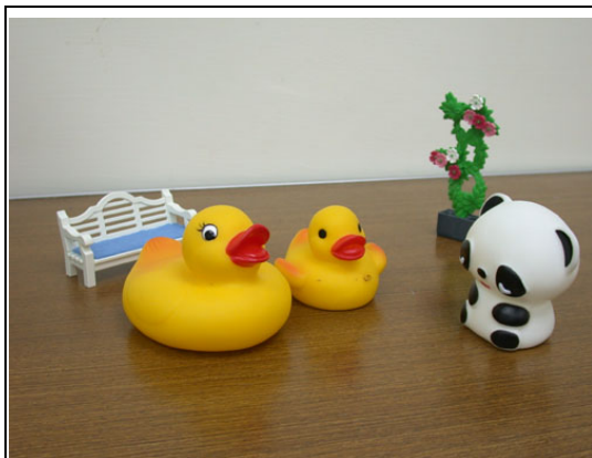
1. A panda is playing hide-and-seek with two ducks — a big one and a little one.

Since the canonical word order is SVO, but relative clauses precede the modified head noun in Mandarin Chinese, the subject in the OO type of relative clause follows the matrix verb. Therefore, according to the NVN word order strategy, the subject of the relative clause may be wrongly interpreted as the object of the matrix verb, and thus the sentence in (10) may be comprehended as the boy rode the panda, and the panda found the duck. That is to say, the original OO type of sentences may be interpreted into two parts, with the argument noun phrase preceding each verb as the agent, and the noun phrase following the verb as the theme. In the story corresponding to the sentence in (10), a panda plays hide-and-seek with two ducks—a big one and a little one, and finds the little duck that hides itself behind a tree. A boy then comes to the playground, and would like to ride the little duck because it looks cute. The little duck begs the boy not to ride it for it is still too tiny to carry the boy. At that moment, the big duck comes out to suggest the boy ride it, and the panda also asks the boy to ride it. At the end of the story, the boy rides both the big duck and the panda. Figure 1 illustrates the scenario of the sample story.