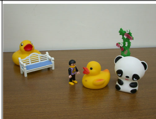
4. A boy comes to the playground, and would like to ride the little duck. The little duck begs the boy not to ride it for it is still too tiny to carry the boy.