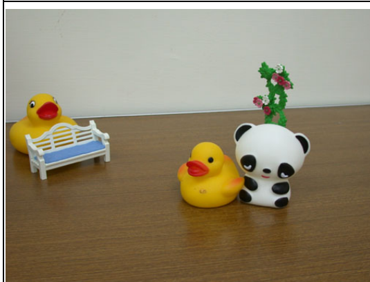
3. The panda finds the little duck, and brings it to the playground.